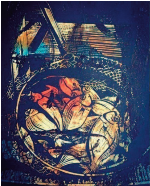
"The Fishnet" Engraving, 2013 30x40 cm