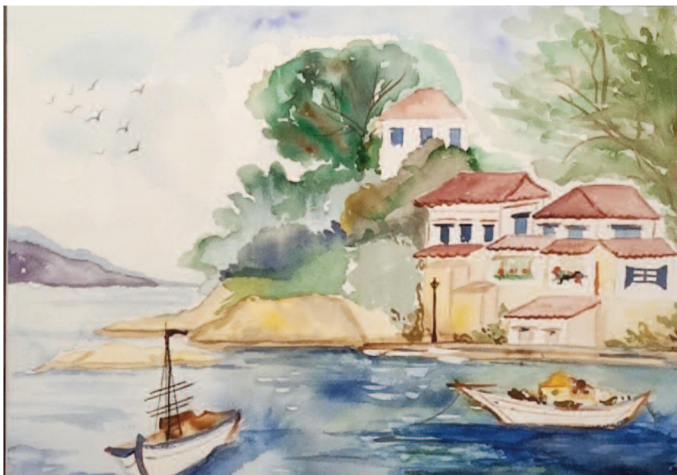
"Skiathos" Watercolor, 2009 40x52cm