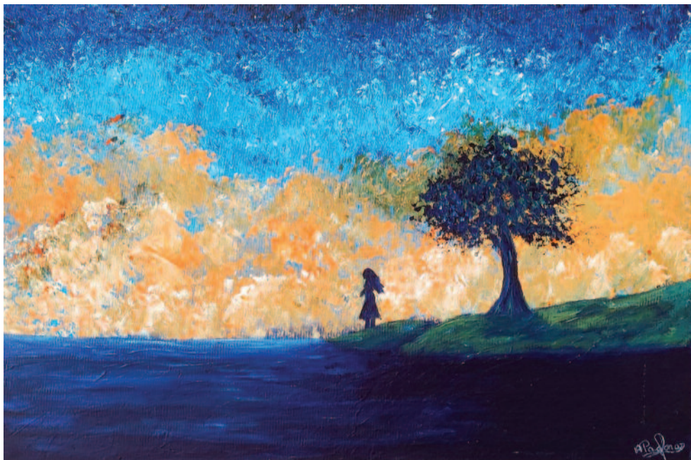
"There is Always Hope" Acrylic, 2020 40x60 cm