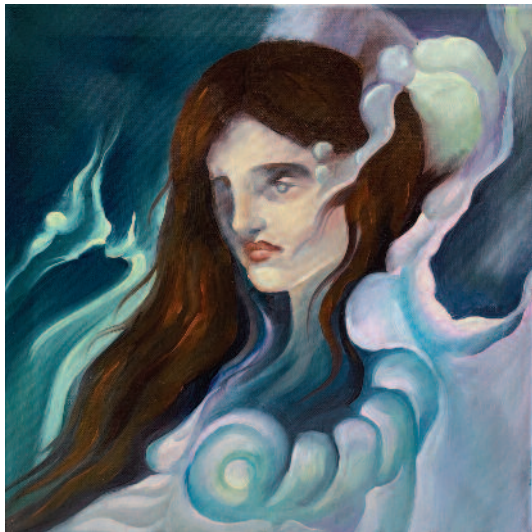
"Siren's Shell" Oil on canvas, 2024 40x40 cm