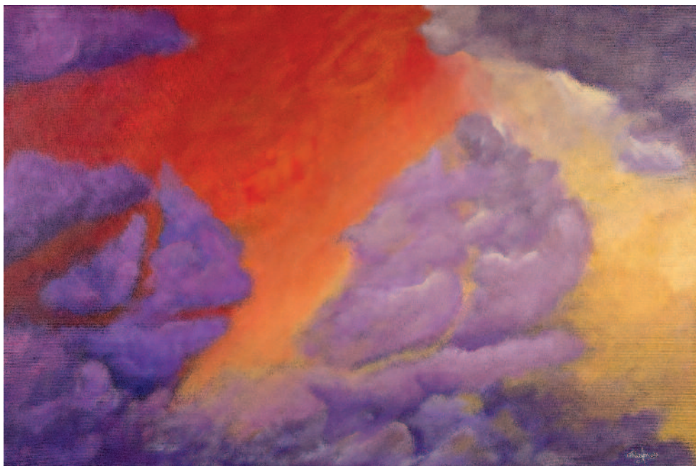
"Sailing The Clouds" Acrylic, 2021 60x90cm