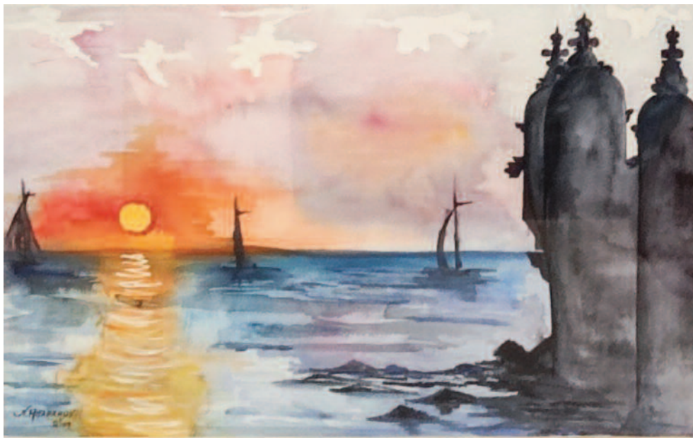
"Sunset" Watercolor, 2009 29x47 cm