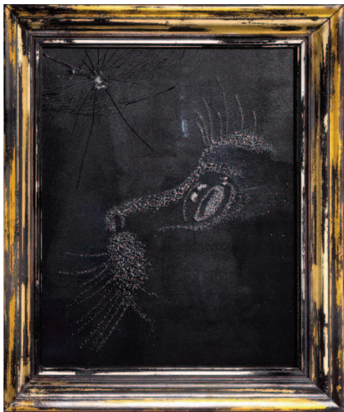
“All Cats are Beautiful”