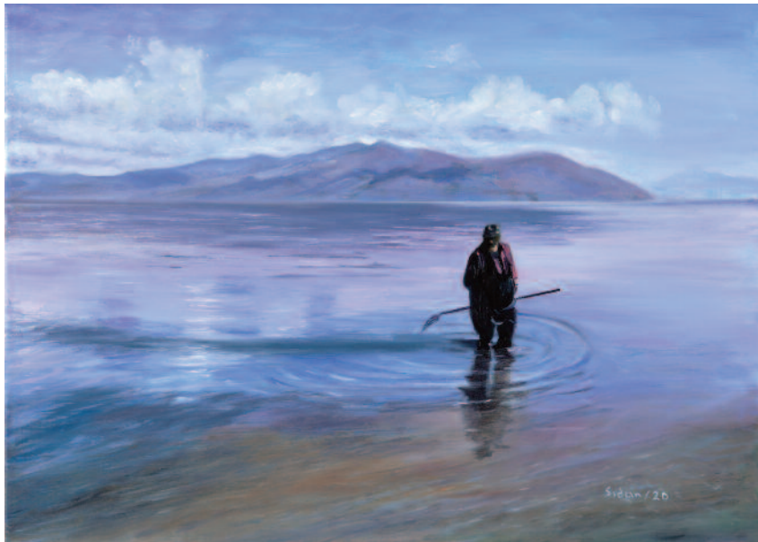
“Evia-Fisherman” Oil on canvas, 2020 50x70 cm