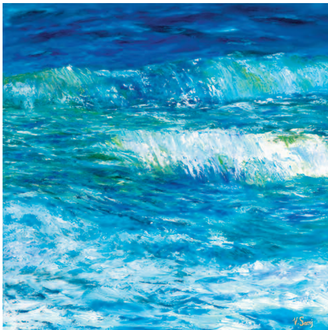
“Boom of Waves”