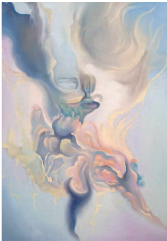
"Eternal Skies" Oil on canvas, 2024 50x70cm