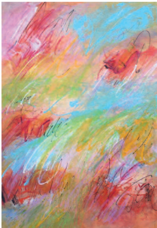
“Joy of Life”