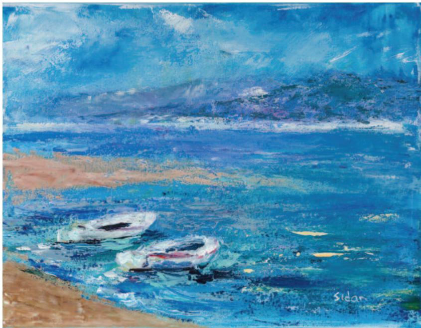
“Sun, Sea and the Wind” Acrylic on canvas, 2024 35x45cm