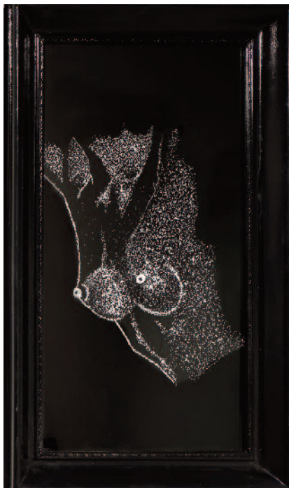
“The Sand Girl”